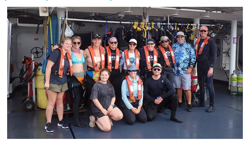
The NOAA Ship Nancy Foster science party composed of researchers and divers from seven different organizations.

Each summer, Gray's Reef National Marine Sanctuary invites researchers aboard the NOAA Ship Nancy Foster for a multi-day research expedition in the South Atlantic Bight. This year's expedition focused on exploring live-bottom habitats outside of the sanctuary's boundaries. Partners from the Georgia Aquarium dive team, University System of Georgia, and NOAA explored 34 areas collecting video transect, species surveys, and ledge shape measurements.