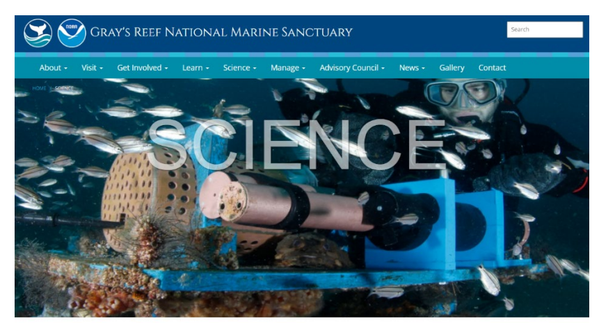
Gray's Reef National Marine Sanctuary is a catalyst for research. Universities, aquaria, state and federal researchers conduct studies inside and outside the sanctuary, utilizing the sanctuary's research area.

Gray's Reef is a representative area of natural, live-bottom habitat commonly found in the coastal southeast. Studies on coral growth, research on loggerhead sea turtles, and the long-term monitoring of fish populations help make informed management