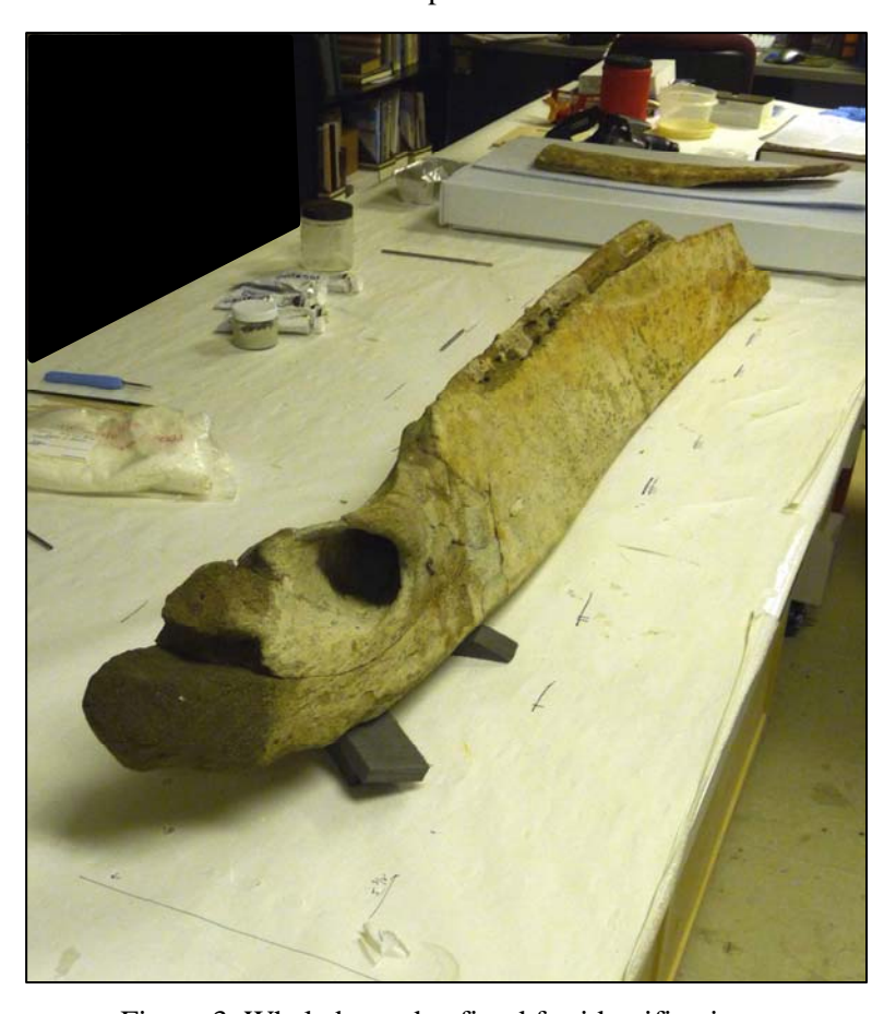
Figure 3. Whale bone dry-fitted for identification.

As soon as the whale bone arrived in Athens, the fragments were placed in fresh water to dissolve the chloride salt crystals from inside the bone. The fragments were soaked for approximately two months with the water periodically replaced before being removed and laid out to air dry. Once dried, the bone fragments were assembled (Figure 3). Since the bone had been well preserved and held in place by the surrounding sediment, most of the pieces had a very good fit. The recovered bone measured 1.5 m in length and weighed approximately 22 kg. It was clear that the bone was that of a baleen whale mandible, but further investigation would be required to determine the species. Pictures were taken of the mandible and sent out to cetacean experts for review.