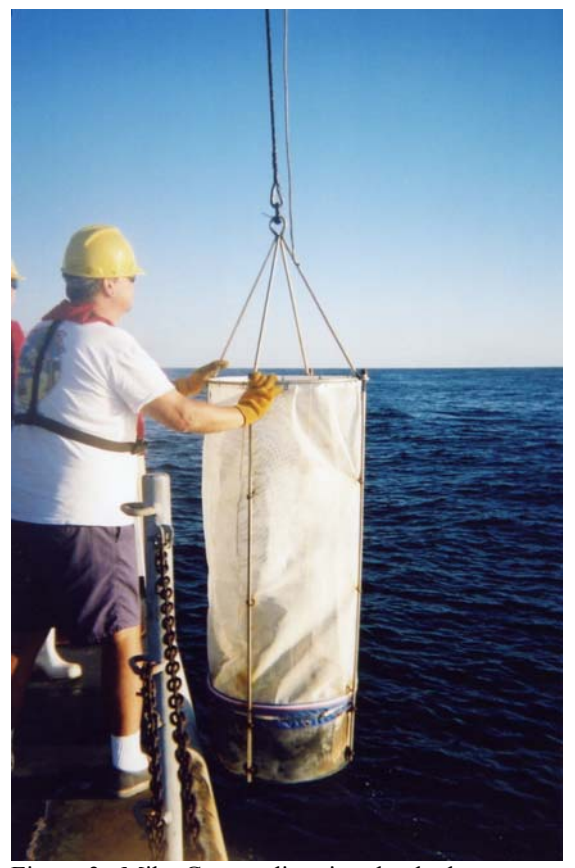
Figure 3. Mike Greene directing the deployment of a settlement trap.

On 26 October (approximately 0800), the gill nets were retrieved. Net 1 (surface net) was found approximately 4 km away from its station, a probable result of wave/current action over night. Fish were sorted, counted and measured according to fishing depth (surface, mid and bottom) and mesh size. Several specimens were photographed for identification purposes (small sharks) and frozen for later identification and gut analyses (sea basses, carangids). One notable exception was a large bull shark. approximately 8-10 feet in length, which was wrapped in the surface net. Fortunately, it was untangled without apparent injury and released unharmed. Gill net results are summarized in Appendix V.